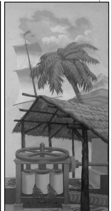
The Post Office mural depicts the historically celebrated industrial achievements of Medford including shipbuilding, brickmaking and rum. (center) An enslaved African in the West Indies hauls sugar cane which will be made into molasses and shipped to Medford for rum making.

John Shaw Billings, the first director of the New York Public Library.