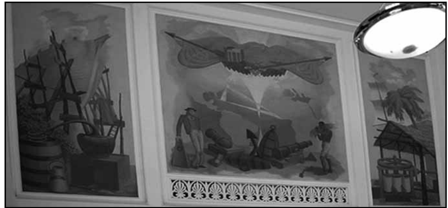
Medford's first public art installation, a mural called "Golden Triangle of Trade" by artist Henry Billings, was dedicated in 1939.