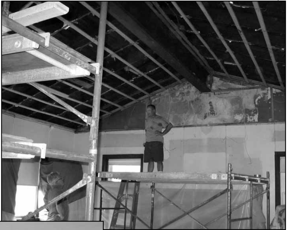
Main Hall of MHS with beams exposed (above) , and with replaced ceiling (left).

Finally, about a year ago, when I was in the building on a Spring day, I saw the source of the water. You may recall the massive iron beam which runs the length of the main hall at the very top of the ceiling. It had been very warm and humid for a number of days, followed by a