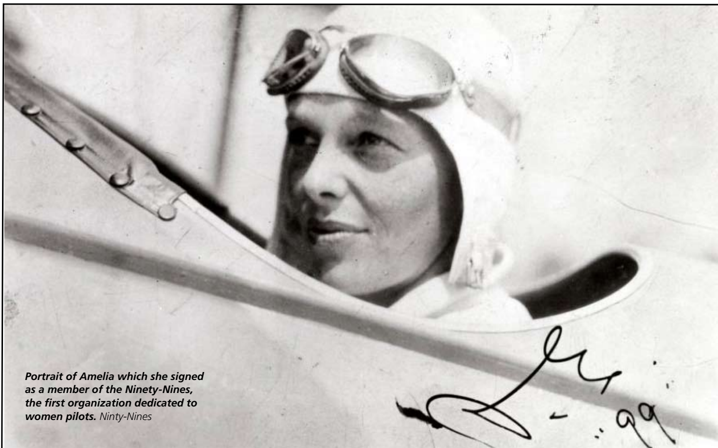
Portrait of Amelia which she signed as a member of the Ninety-Nines, the first organization dedicated to women pilots. Ninty-Nines

Your Medford Historical Society Newsletter